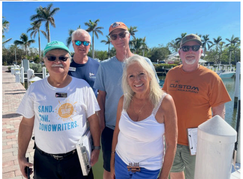
Run E on November 19, lunch following the run at Gramma Dots on Sanibel and a total of 29.3 miles traveled