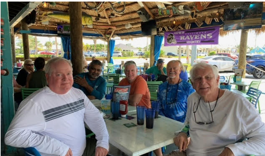
Run A on November 18, with lunch following the run at FINS in Cape Coral