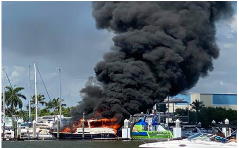
Fire destroyed a boat at Salty Sam's Marina in Ft. Myers, August 29, 2020

Boat fires can happen at any time and anywhere - at the dock, while fueling or when you are out on the water. How you react can vary but the basics remain the same. Here are some things to help you think about in terms of preparing for and reacting to a fire on your boat.